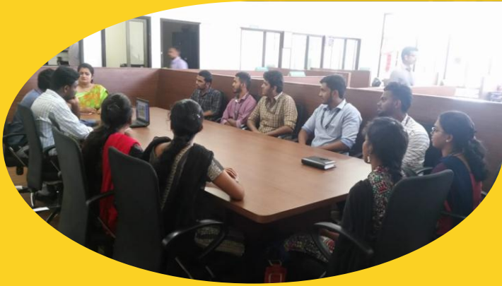
ICE Department – Department association activities discussion meeting with student coordinators