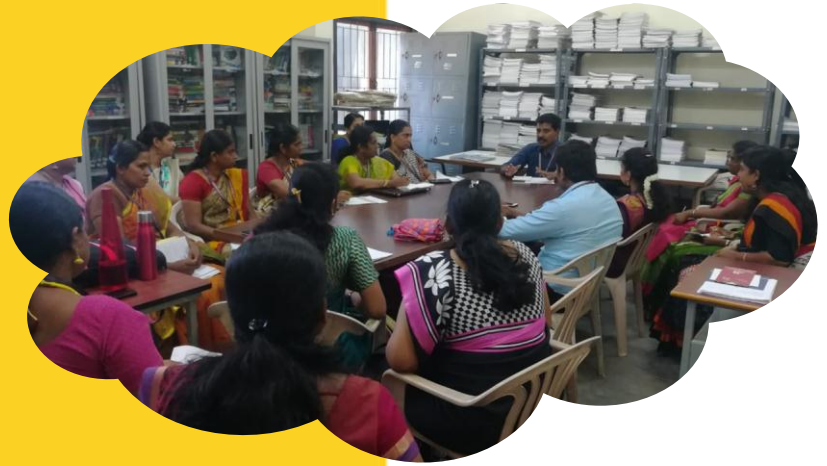
ICE Department –Project phase 1 review and discussion was done by the Faculty members in the department.