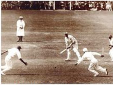
First Test-India & England at Lord's