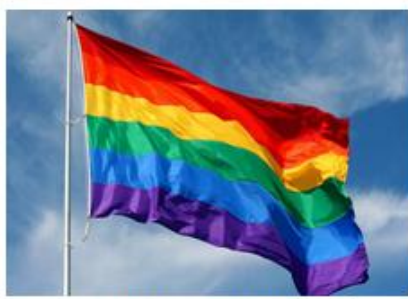
The Rainbow Flag