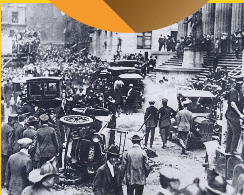
Aftermath of the attack on Wall Street, September 16, 1920