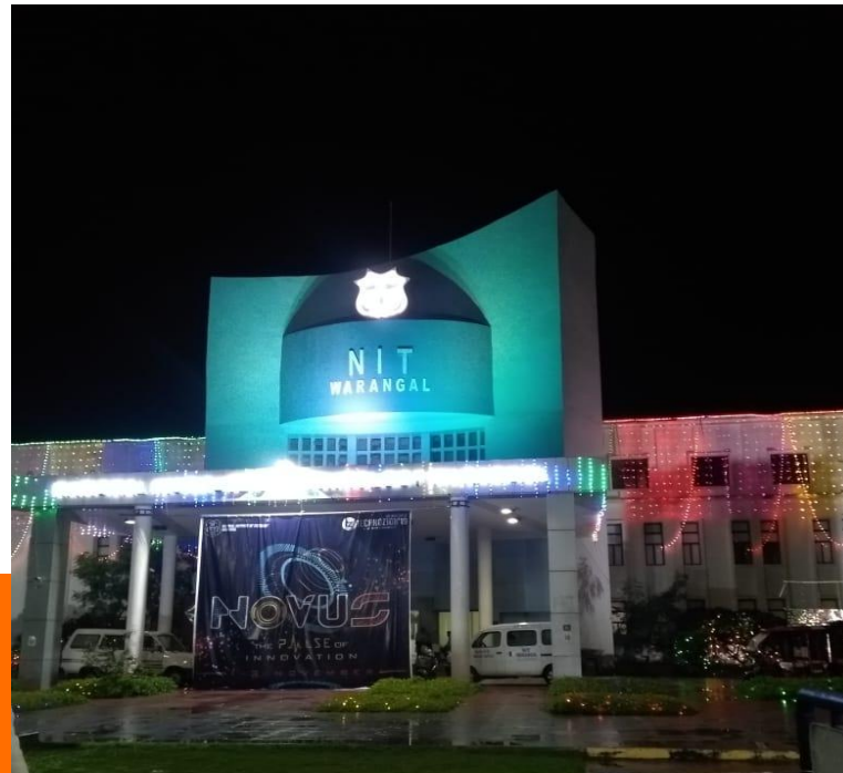
TECHNOZION 2K19 at NIT Warangal.