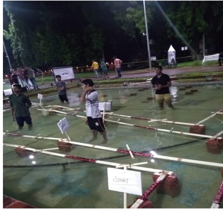
TECHNOZION 2K19- HOVER MANIA Event