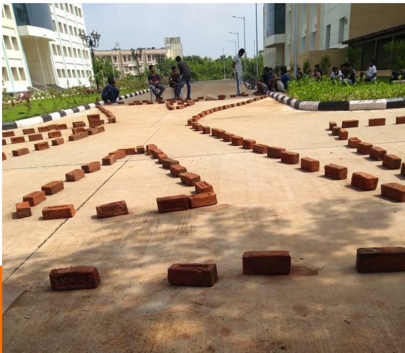
TECHNOZION 2K19- RC Nitrocar Event track