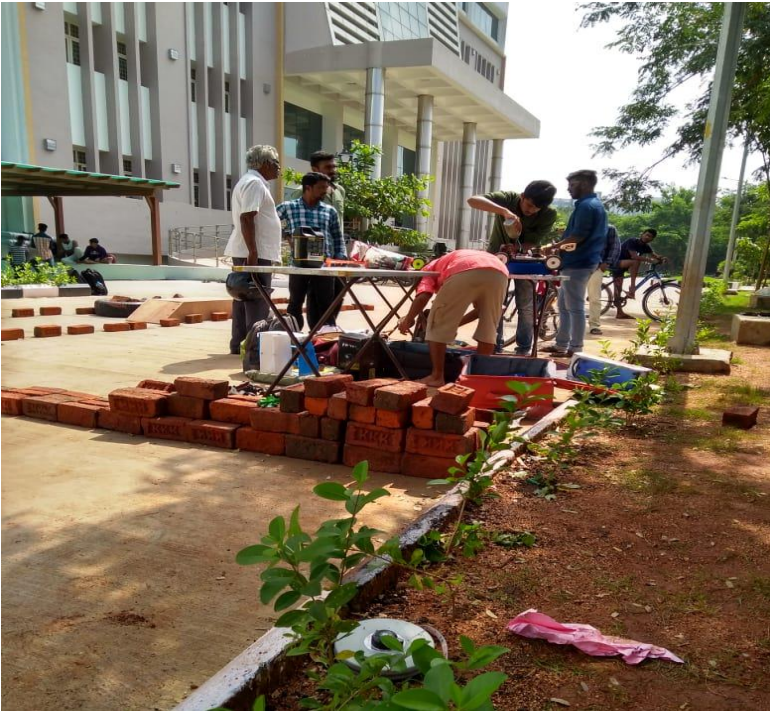
TECHNOZION 2K19- RC Nitrocar Racing Event