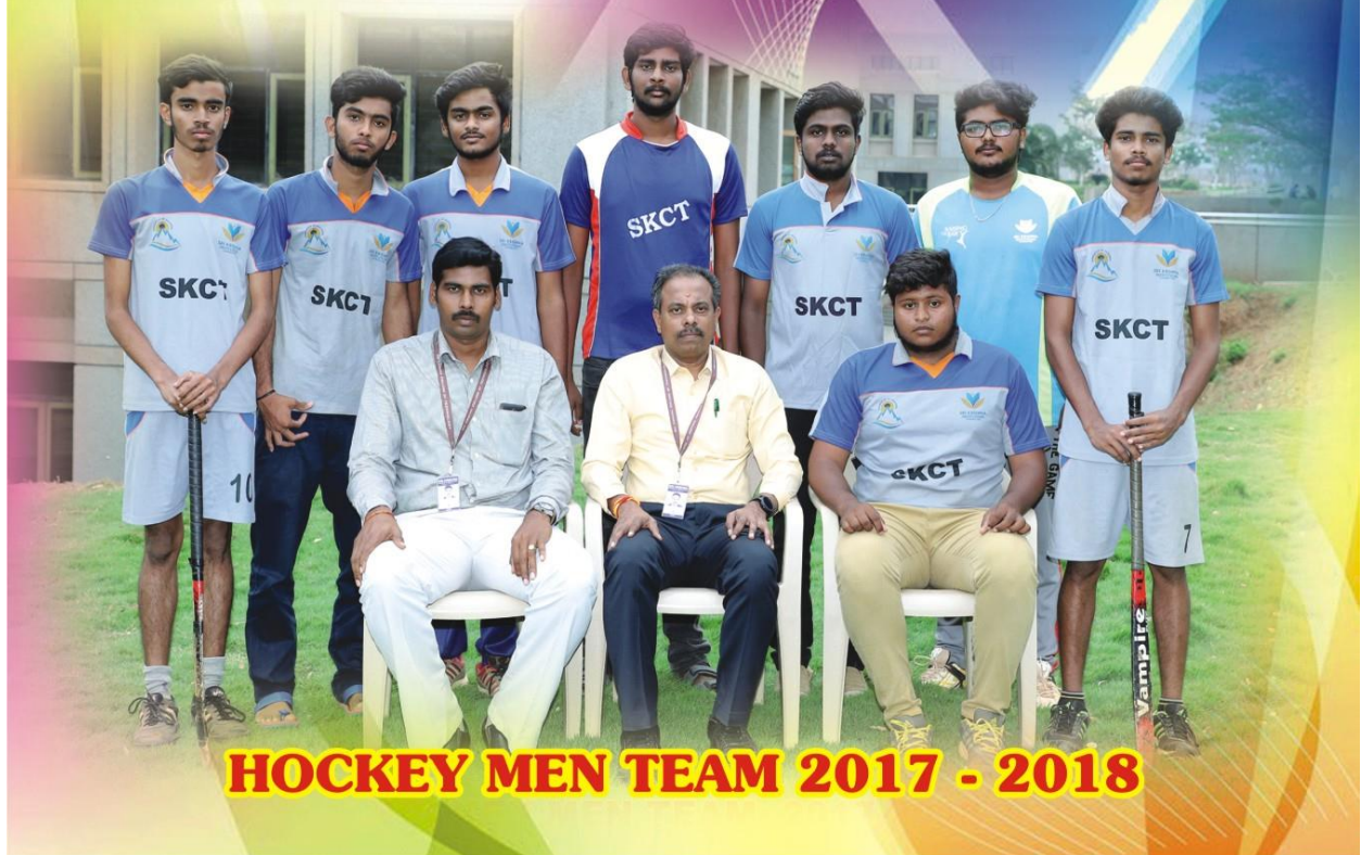
HOCKEY MEN TEAM 2017 - 2018