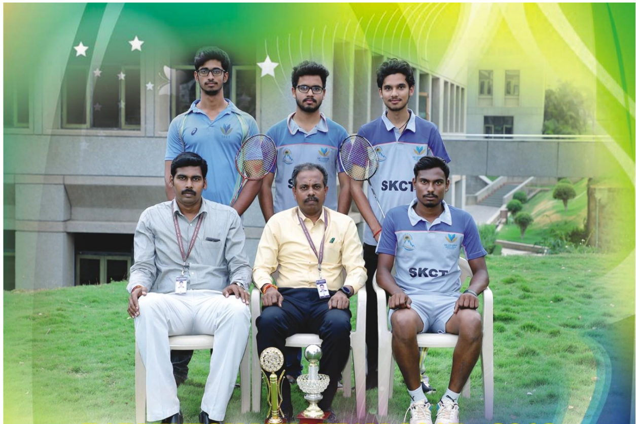
BADMINTON MEN TEAM 2017 - 2018