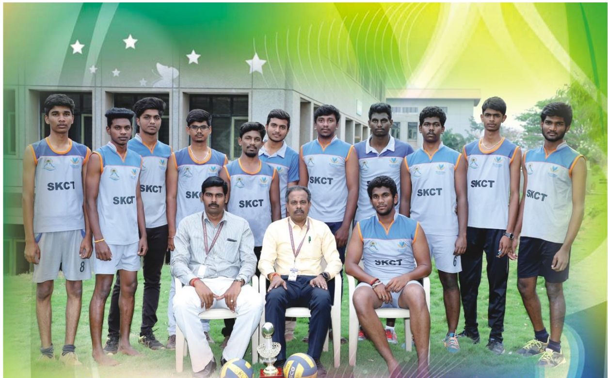
VOLLEYBALL MEN TEAM 2017 - 2018