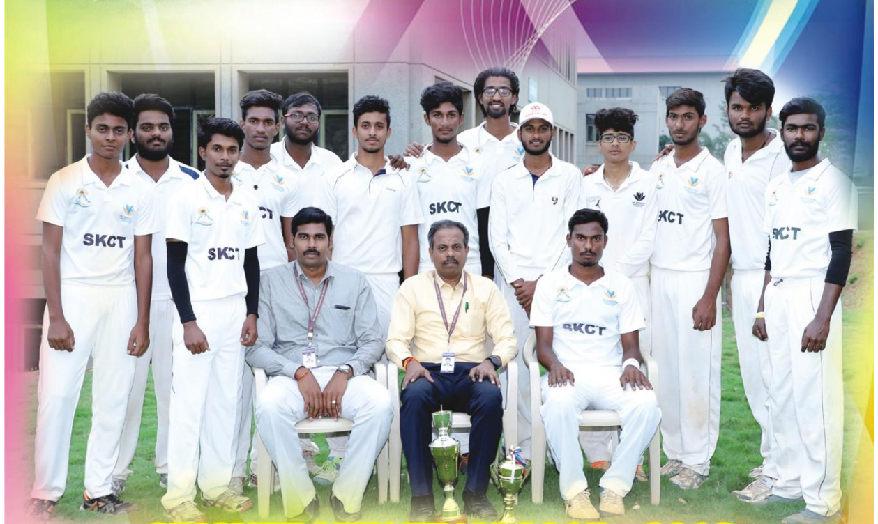
CRICKET MEN TEAM 2017 - 2018