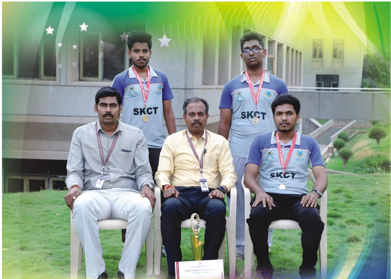
TABLE TENNIS MEN TEAM 2017 - 2018