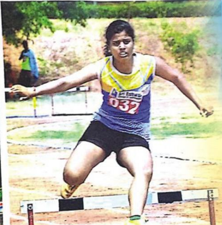
இந்த விளையாட்டுகளை விடியோவை தயார் செய்து 'டோனல் ஆப்ஸ்' இலவசமாக பதிவிறக்கம் செய்து அலகது www.donalds.com தளத்தில் பார்க்கலாம்.