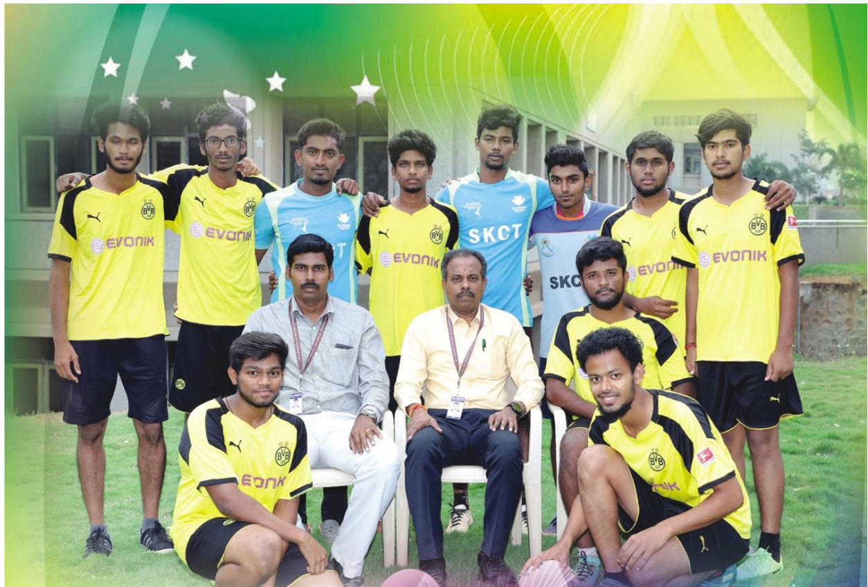
FOOTBALL MEN TEAM 2017 - 2018