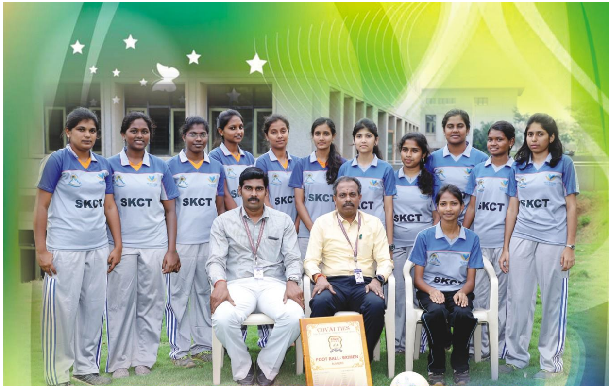
FOOTBALL WOMEN TEAM 2017 - 2018