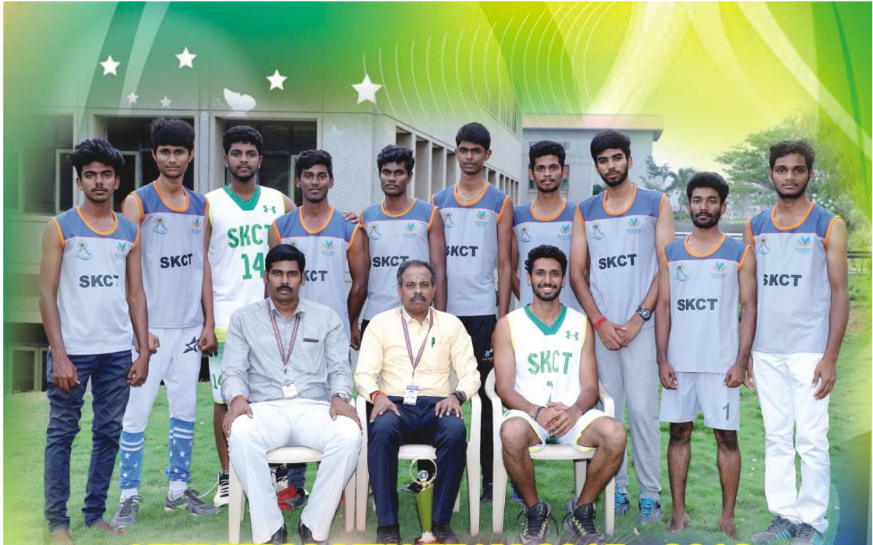
ATHLETICS MEN TEAM 2017 - 2018