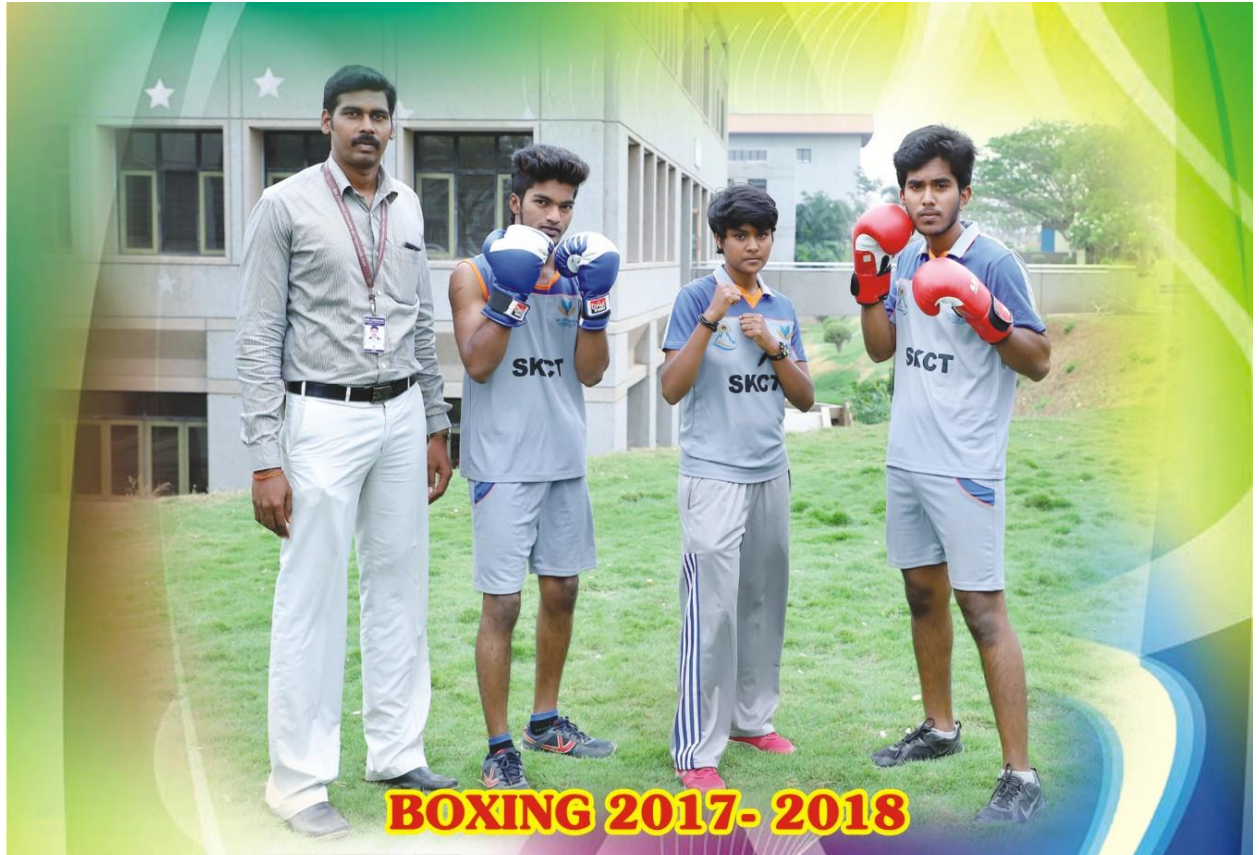
BOXING 2017- 2018