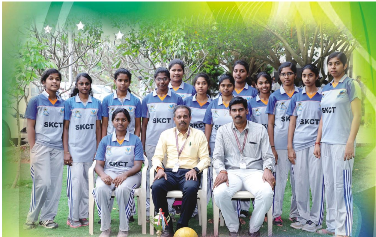
THROWBALL WOMEN TEAM 2017 - 2018