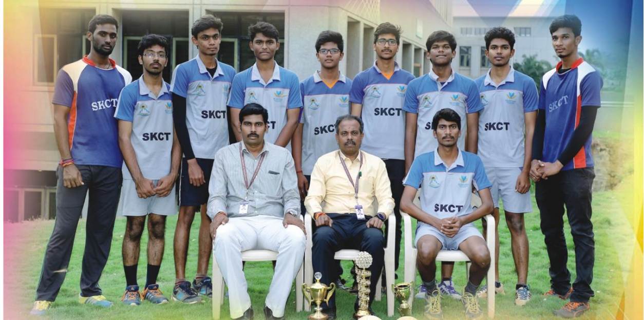
HANDBALL MEN TEAM 2017 - 2018