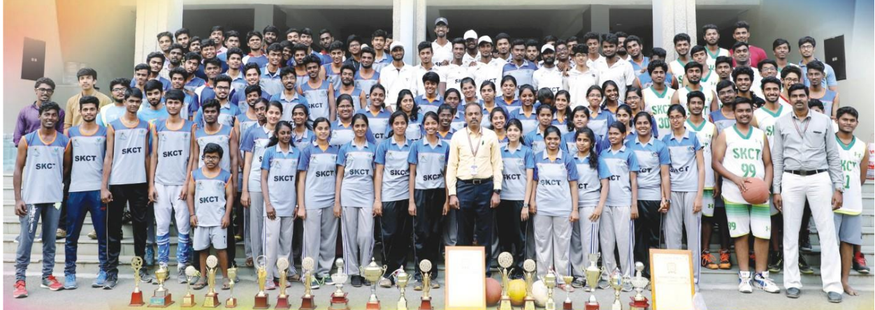
MEN & WOMEN TEAM 2017 - 2018