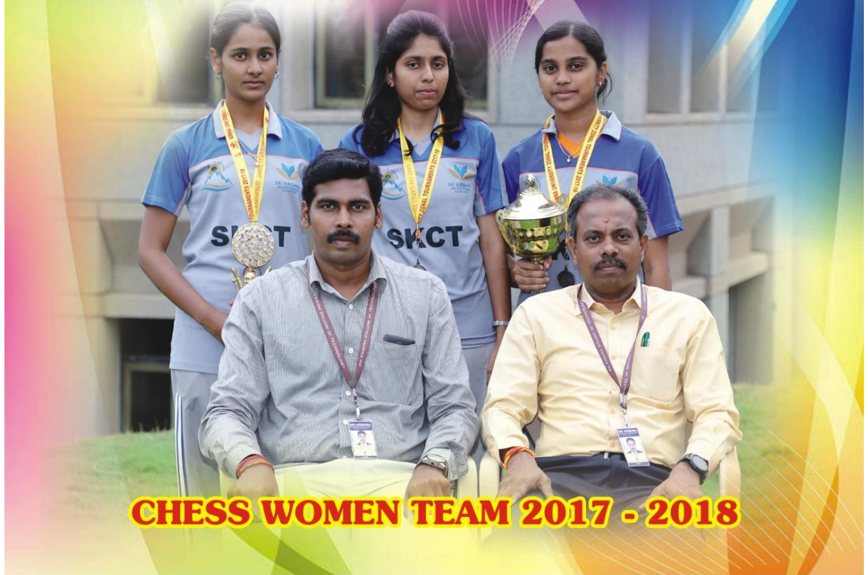
CHESS WOMEN TEAM 2017 - 2018