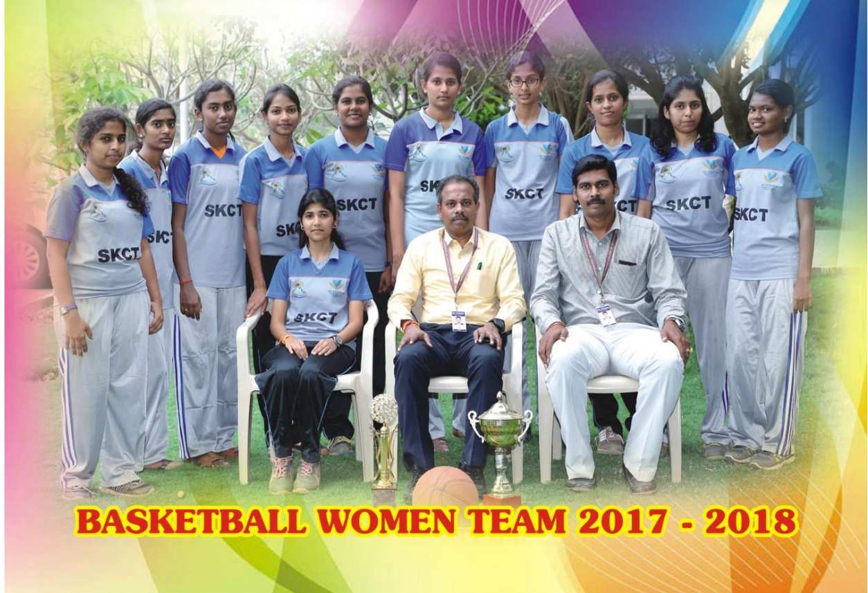
BASKETBALL WOMEN TEAM 2017 - 2018