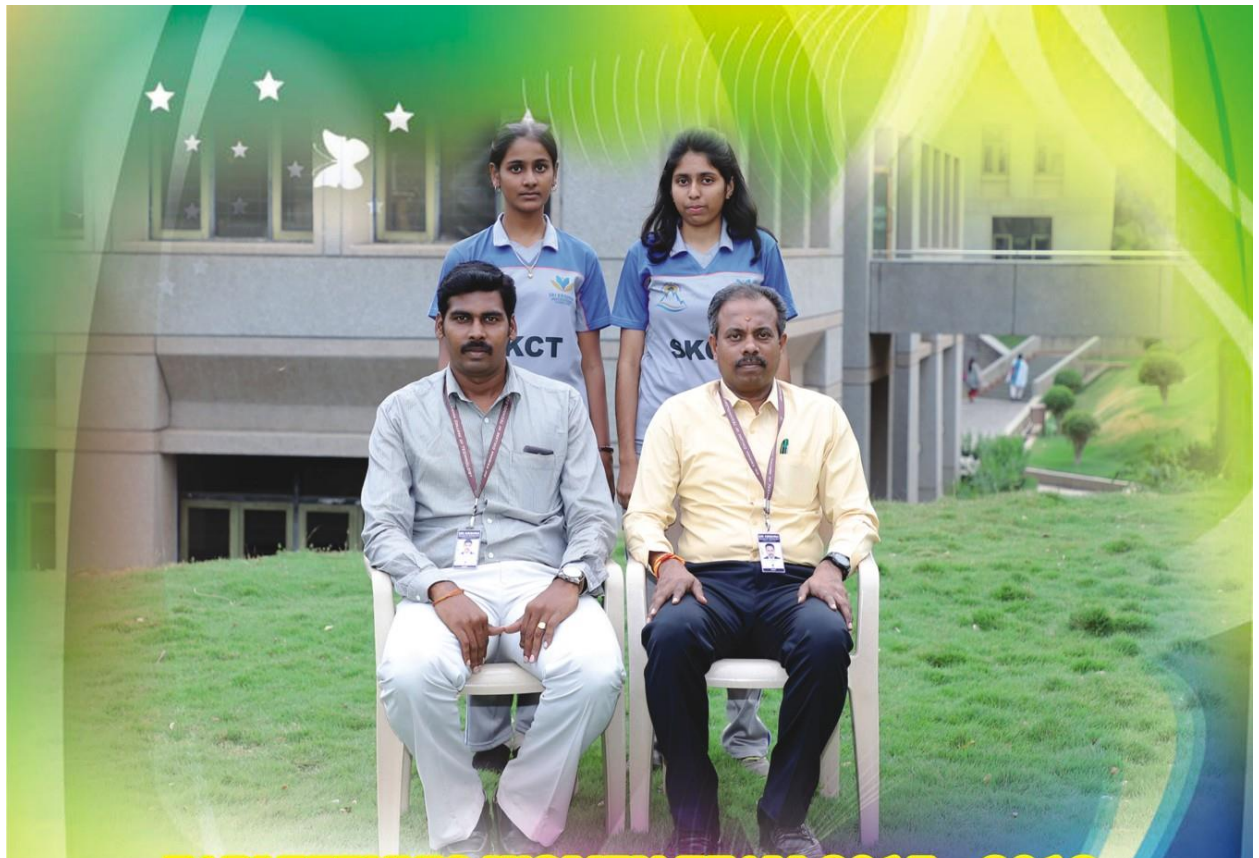
TABLE TENNIS WOMEN TEAM 2017 - 2018