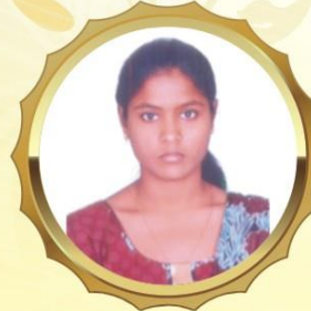
KOUSALYA V. IV CIVIL - BOXING