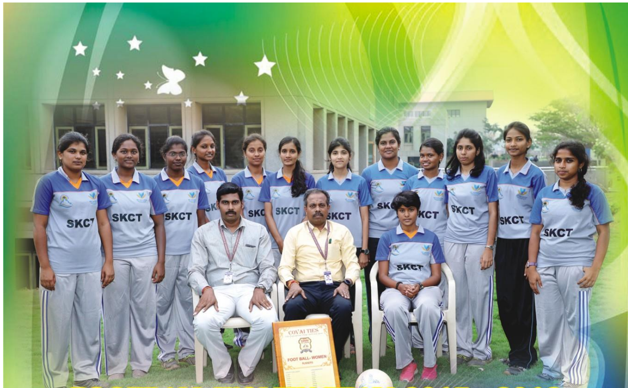
FOOTBALL WOMEN TEAM 2017 - 2018