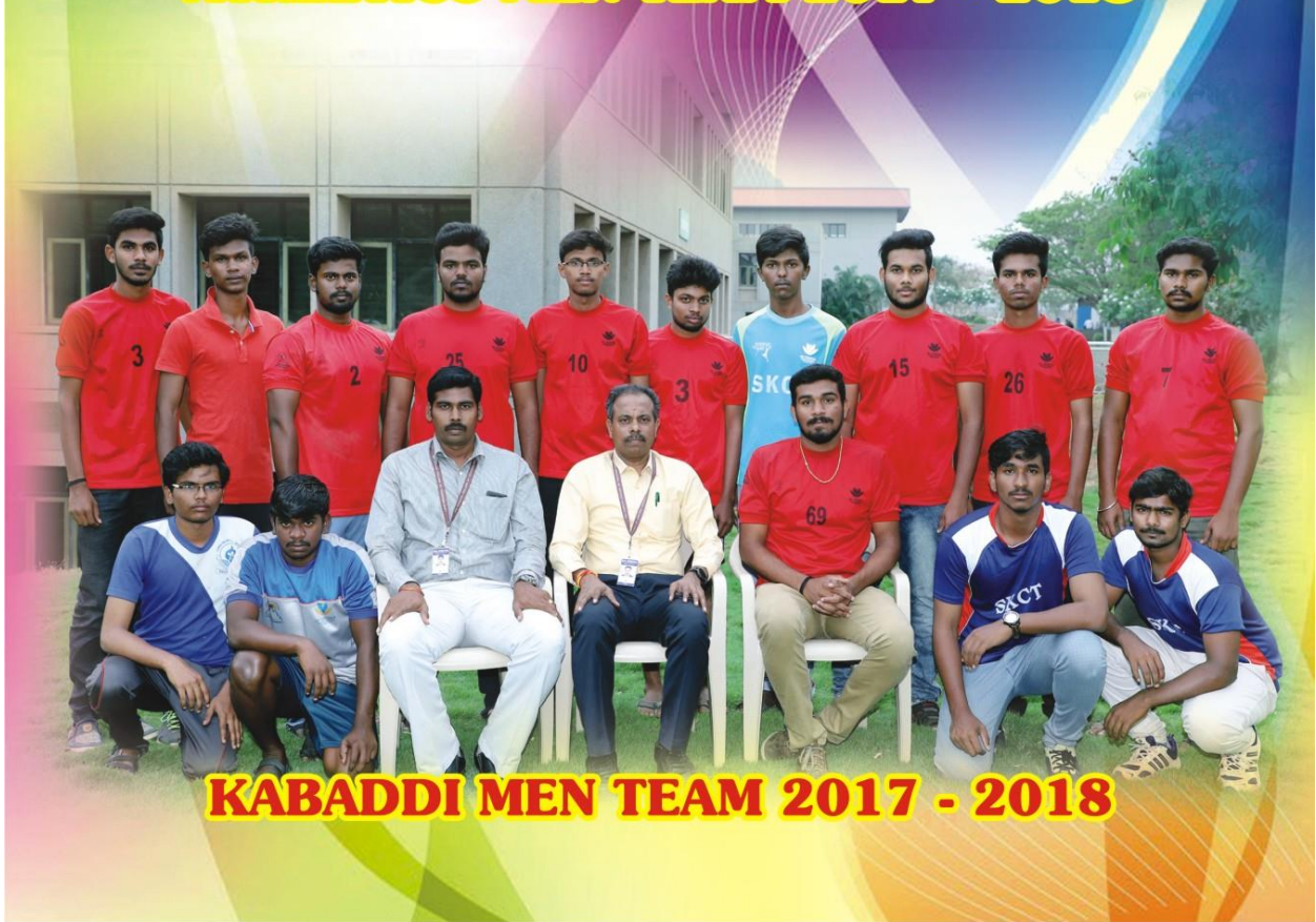
KABADDI MEN TEAM 2017 - 2018