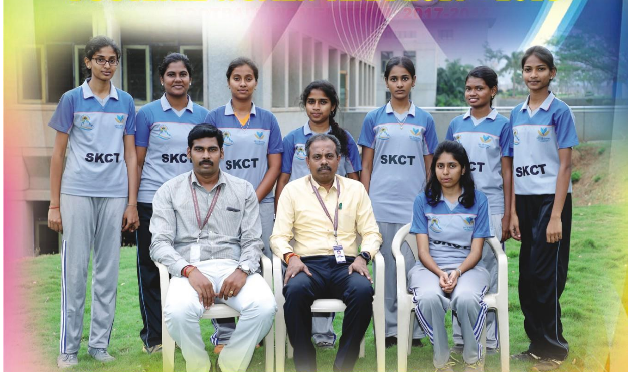
BALL BADMINTON WOMEN TEAM 2017 - 2018