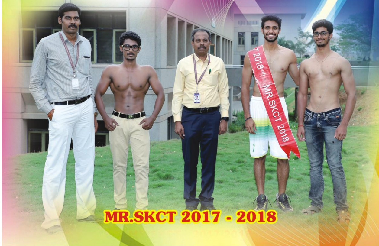
MR.SKCT 2017 - 2018