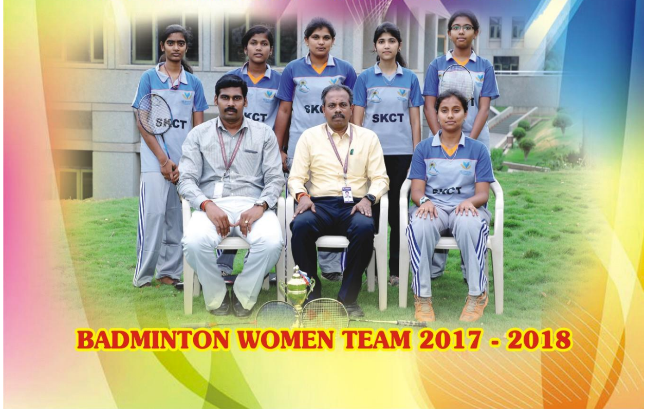
BADMINTON WOMEN TEAM 2017 - 2018