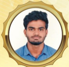
G.K.UDAYA IV CIVIL - FOOTBALL