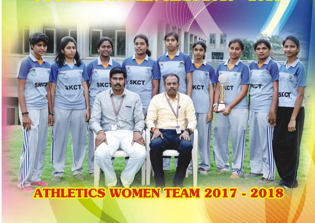
ATHLETICS WOMEN TEAM 2017 - 2018