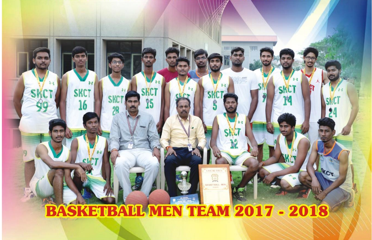
BASKETBALL MEN TEAM 2017 - 2018