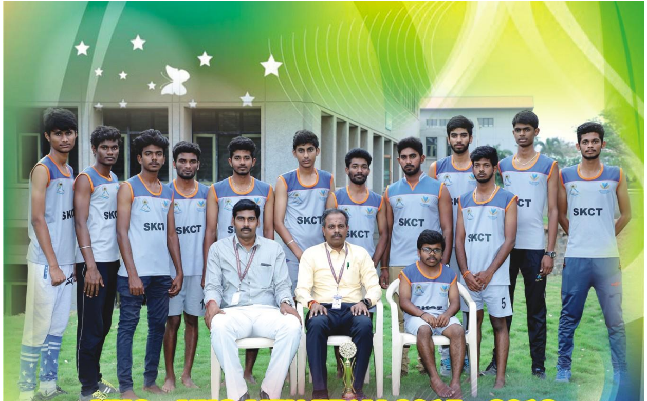
KHO - KHO MEN TEAM 2017 - 2018