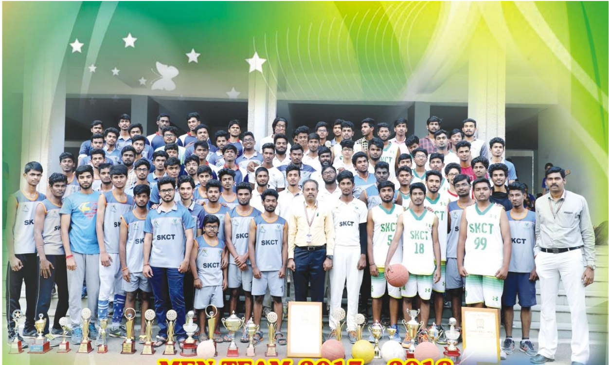
MEN TEAM 2017 - 2018