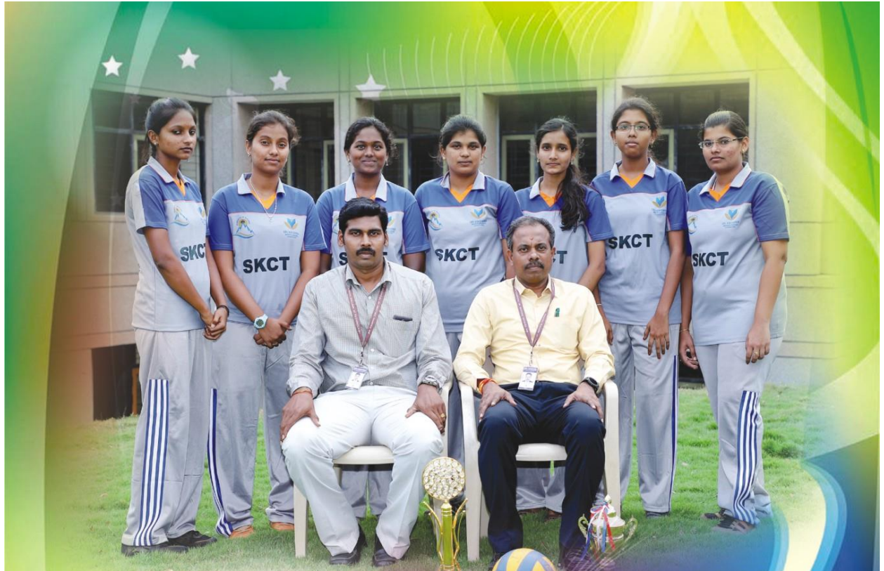
VOLLEYBALL WOMEN TEAM 2017 - 2018